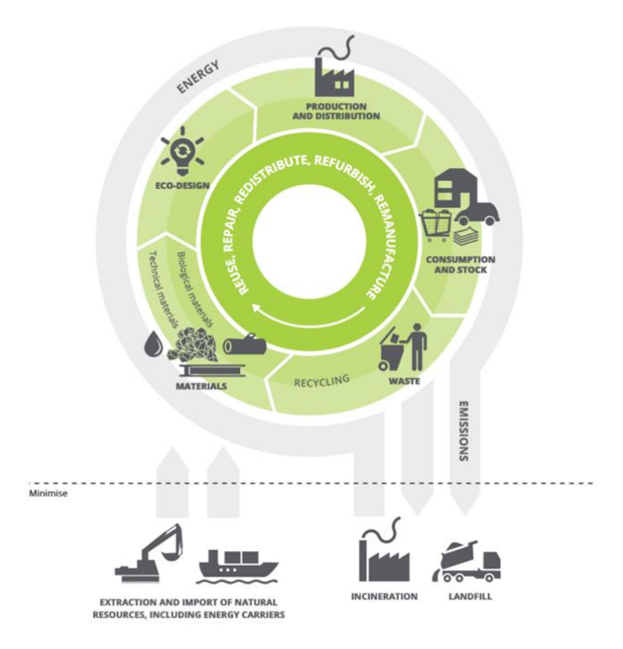
Image 18.1: A Simplified Model of the Circular Economy for Materials and Energy (European Environment Agency (EEA) 2016)

The principal objective of sustainable resource and waste management is to use resources more efficiently, where the value of products, material and resources is maintained in the economy for as long as possible such that the generation of waste is minimised. To achieve resource efficiency there is a need to move from a traditional linear economy to a circular economy (refer to Image 18.1).